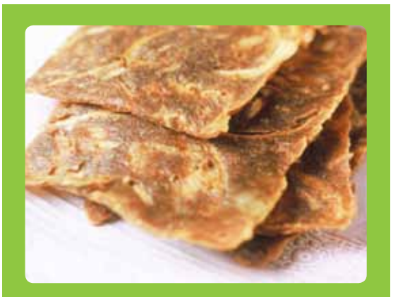
Matt's recipe Onion Bread Crisp, (Courtesy of Matt Amsden, RAWvolution)